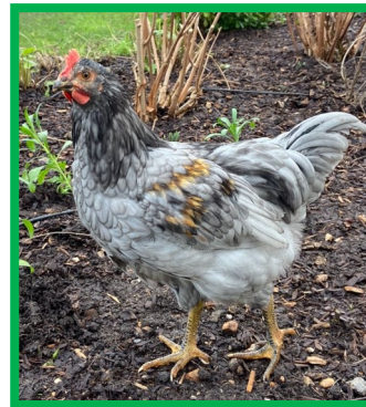
Gayhurst's chicken Chickpea

They love being outside and munching on whatever greens they can find in the garden. Their favourite though are sorrel, chard and beetroot leaves.