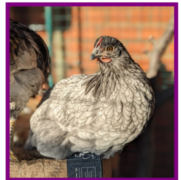
Kingsmead's chicken Sunflower