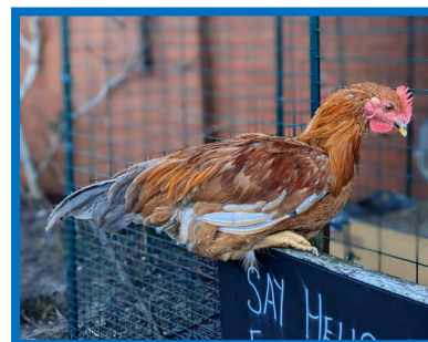
Mandeville's chicken Pumpkin