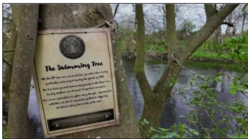
A Talking Tree Collective mystery sign